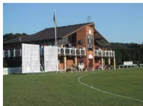
Tring Clubhouse in all its glory on a sweltering sunny Saturday Afternoon